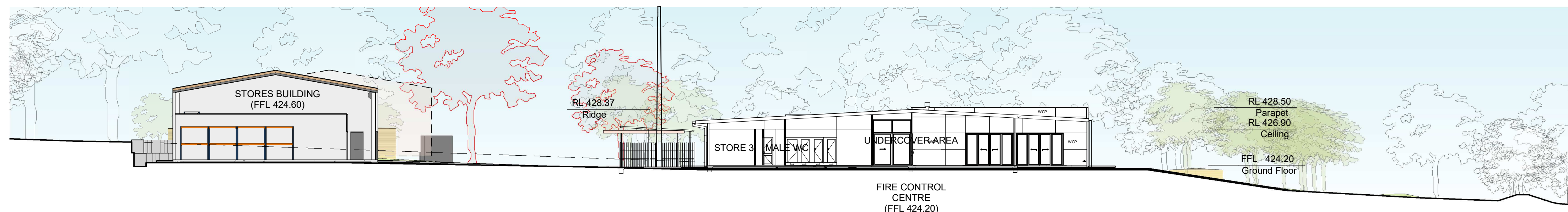
3 TYPICAL SECTION 1 : 200